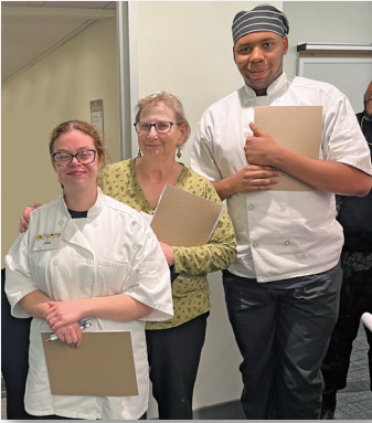
ETC's Culinary Certificate Graduates present at TILL's Fiscal Breakfast.

ETC Café, Gift Shop and Food Service in Hyde Park offers culinary and retail training in our entrepreneurial business, with our Artisans' creativity on display in our shop.